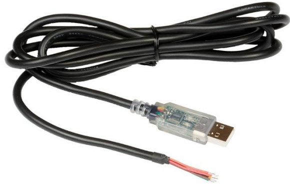
NMEA 0183 to USB Adaptor – AU$ 79 ex GST