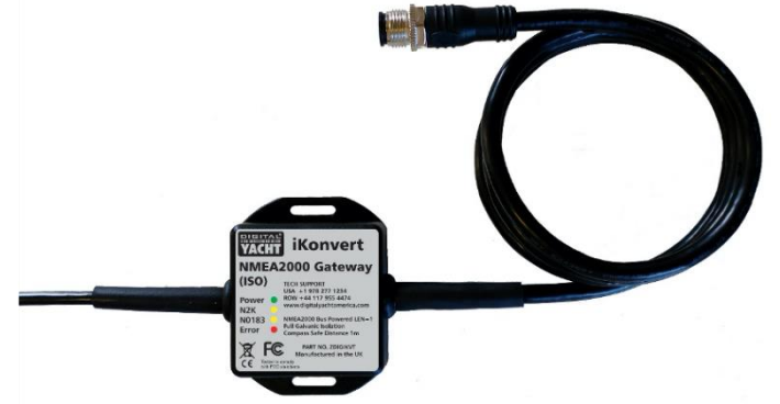
iKonvert NMEA 2000 to USB – AU$ 249.95 ex GST